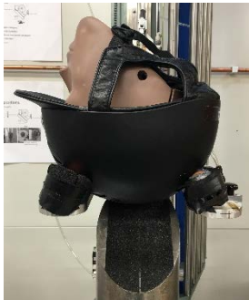
Figure 2. The oblique test A with rotation around X-axis.

low-pass filter. This is further described by Aare and Halldin (2003). The helmeted head was dropped against a 45° inclined anvil with friction similar to asphalt (grinding paper Bosch quality 40). The impact speed was 6.25m/s. The Hybrid III dummy head was used without an attached neck. Two helmets were tested in each test configuration to minimize variations.