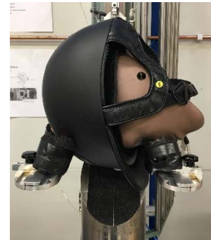
Figure 4. The oblique test C with rotation around Z-axis