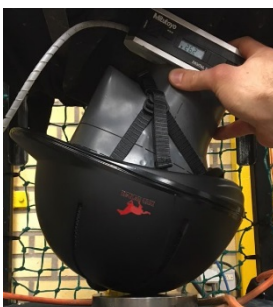
Figure 1. The method used in shock absorption test. The head's initial angle was 26°.

The test was performed by Research Institutes of Sweden (RISE) which is accredited for testing and certification in accordance with the interim European Standard VG1 (01.040: 2014-12).